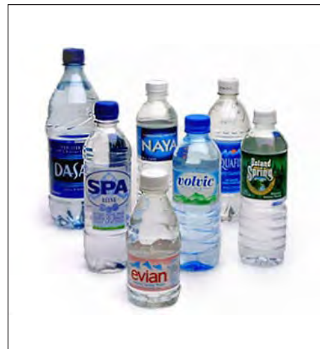
New FDA regulations allow a solution of silver nitrate and hydrogen peroxide in bottled water to kill germs

The petition that prompted this ruling proposed as a condition of safe use that the silver nitrate and hydrogen peroxide additive not be used in bottled water that has been or is intended to be filtered with a silver-containing water filter because this might add additional silver to the water. "Thus, the use of the subject additive in bottled water will not increase consumer exposure to silver. Because there is no increase in the intake of silver beyond a level that has already been established as safe, FDA has no concerns regarding the petitioned use of silver as a component of this additive," the ruling noted.