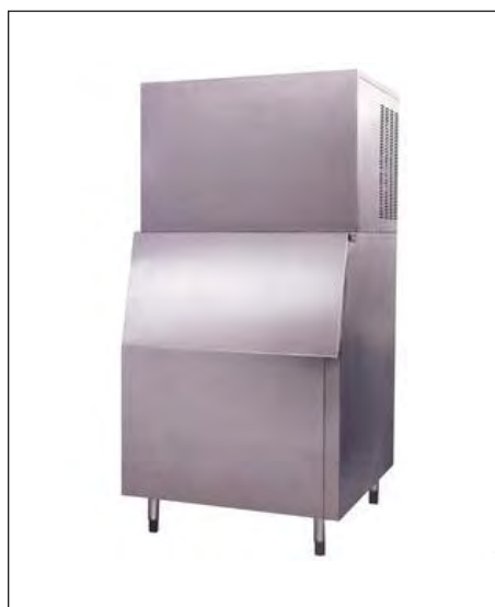
Many industrial icemakers use imbedded silver particles to help kill pathogens.

Manufacturers of antimicrobial silver (often in partnership with their customers) currently are submitting registration applications to the EPA and other regulatory agencies, and more are expected.