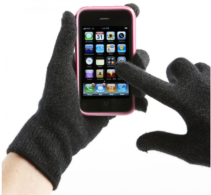
These silver-fingertipped gloves allow you use touchscreens while keeping your hands warm.

The gloves’ materials are durable, composed of continuous filament nylon and spun polyester, and the silver does not wear or wash off. They come in three styles: Agloves for about US$18, and Sport and Bamboo , each about US$24.