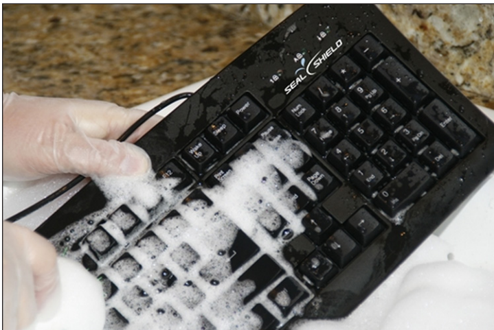
This washable keyboard also contains antibacterial silver.

The company also offers waterproof, washable mice, touchpads and handheld device covers, some with silver.