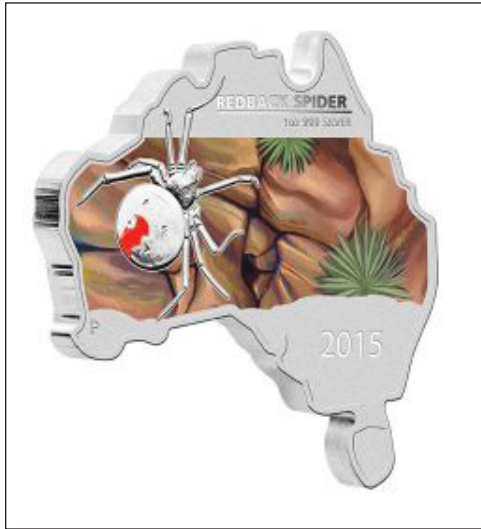
This one-ounce, 99.9% pure silver coin features the Redback Spider on a map of Australia.

About 6,000 of the legal tender coin will be minted and sell for US$72.90 through authorized dealers and the Perth Mint website.