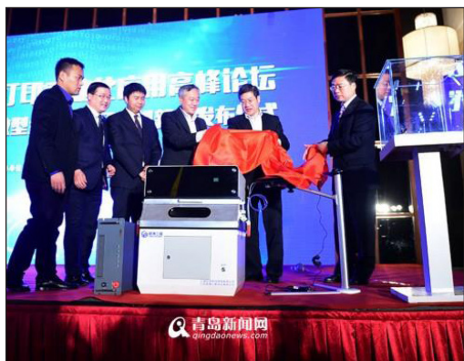
This miniature 3D printer was designed to produce gold and silver jewelry.

The Chinese government is backing 3D technology and an International Data Corporation (IDC) report bears this out: About 34,000 units were shipped within China in 2014, and that number has already more than doubled to over 77,000 units in 2015, says IDC. The global consultancy predicts that 160,000 3D printers will be sold in China during 2016.