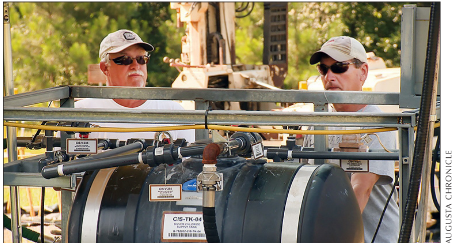
SRNS operators monitor the injection of silver chloride into the aquifer beneath the Savannah River Site. Results of a recent test indicate a significant decrease in the hazard posed by contaminants where silver chloride was injected.

Recent test results indicate that the silver chloride has significantly decreased “the hazard posed by iodine-129” in the F Area aquifer. At the same time, the remedial costs associated with groundwater contaminants have been reduced, resulting in a cost avoidance of approximately 90 percent. The price tag has gone from about $1 million a month to $1 million a year.