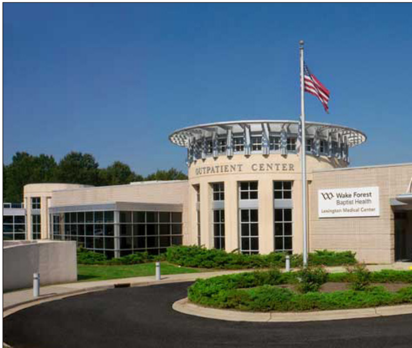
WAKE FOREST BAPTIST HEALTH

Legionnaires' Disease was named after an outbreak of a then-unknown malady that sickened more than 200 people and caused 34 deaths among attendees at a convention of the American Legion, an association of U.S. military veterans, in Philadelphia in July 21–24, 1976.