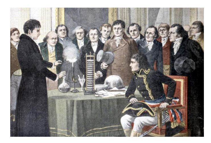
It was reported that Volta 'amazed' Napoleon with his silver-zinc battery

Like many technologies, batteries have a fascinating history. Alessandro Volta is generally agreed to have invented the first practical battery in the early 1800s, which came to be known as the Voltaic Pile. This was a simple stack of metal discs separated by a cloth soaked in brine. After experimenting with a variety of different metals, Volta discovered that zinc and silver provided the most effective combination. The next two centuries saw dozens of developments in the field from scientists all over the world, with different combinations of metals leading to a range of new battery functionalities (for example, dry cells and rechargeability).