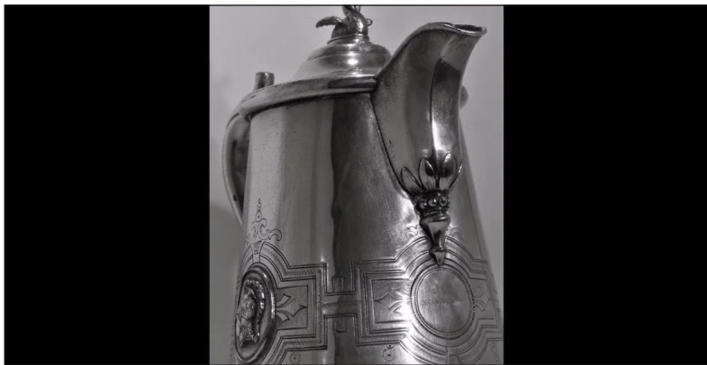
Click the image to watch a video of a Meriden Ice Pitcher.

His goal is not to monetize the collection but to find a museum that could house the collection. “Most importantly, I would like ASM to be a template for museums to use in the exhibition of this incredible expression of silversmithing that they most probably own but can only warehouse.”