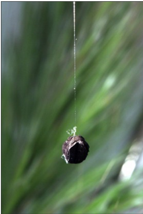
JOSHUA DEOTTE, LAWRENCE LIVERMORE NATIONAL LABORATORY

Silver, gold, and copper aerogels are so light that they can ride on a mosquito’s back.